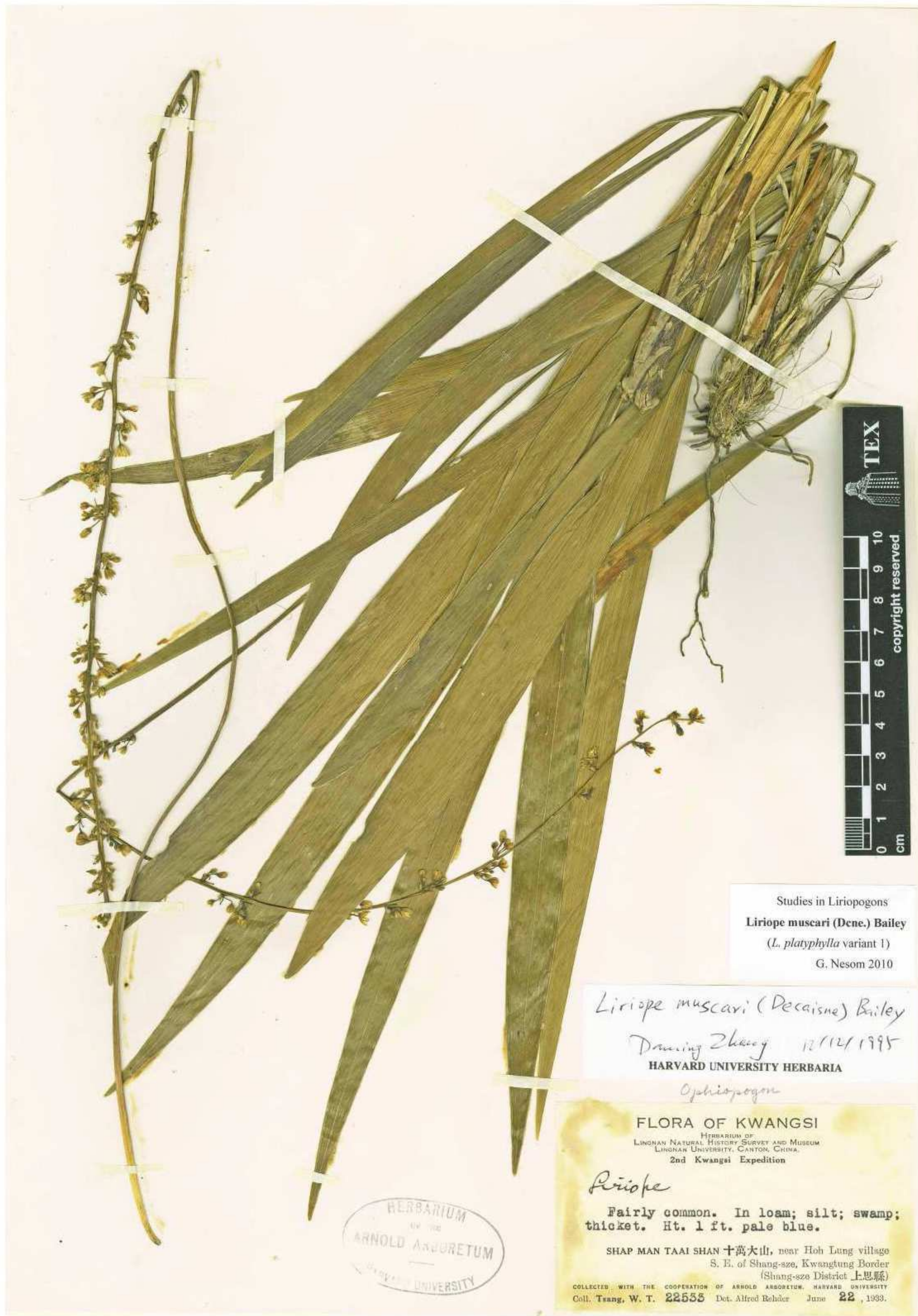
Figure 5. Liriope muscari sensu lato, “platyphylla” expression (see comments in text).